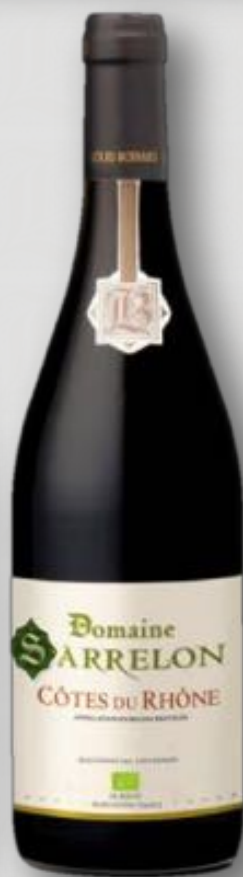
Côtes du Rhône ESTATE