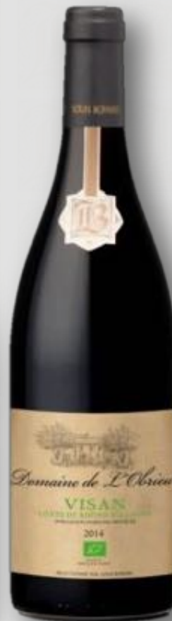
Côtes du Rhône Villages ESTATE