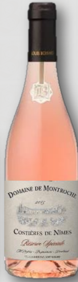
Costières de Nimes