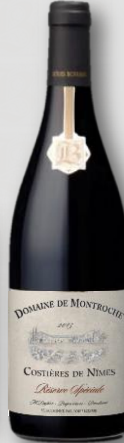
Costières de Nimes