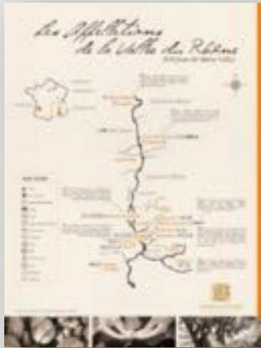
Size 60cm x 85cm H