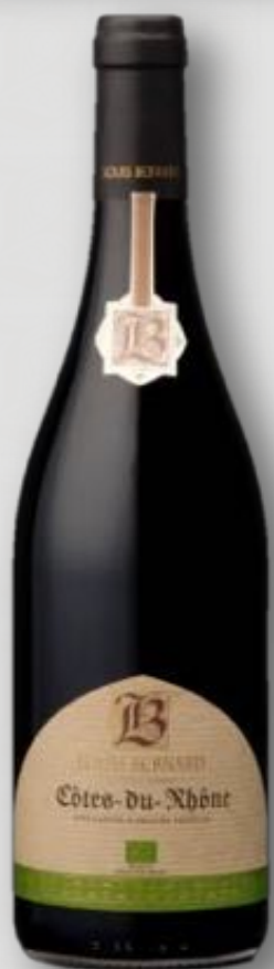
Côtes du Rhône CLASSIC