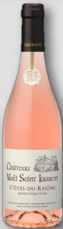
Côtes du Rhône