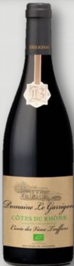
Côtes du Rhône ESTATE