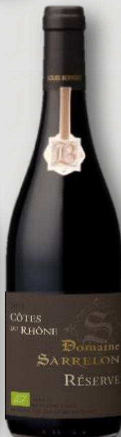
Côtes du Rhône ESTATE