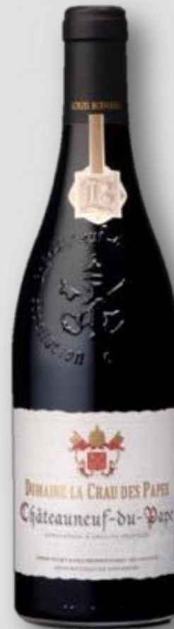
Châteauneuf du Pape