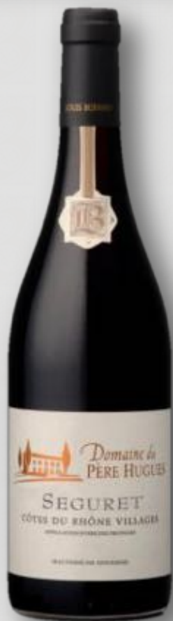
Côtes du Rhône Villages SEGURET