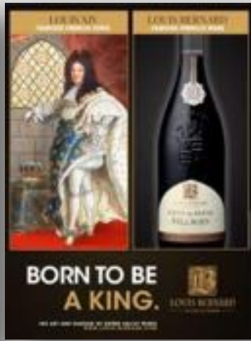
Size 60cm x 85cm H