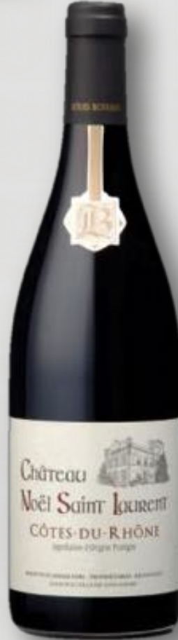
Côtes du Rhône