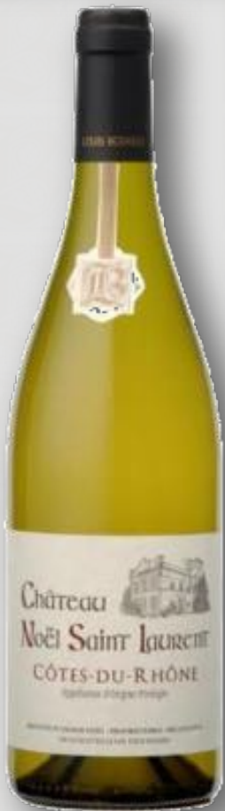
Côtes du Rhône