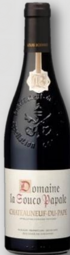
Châteauneuf du Pape